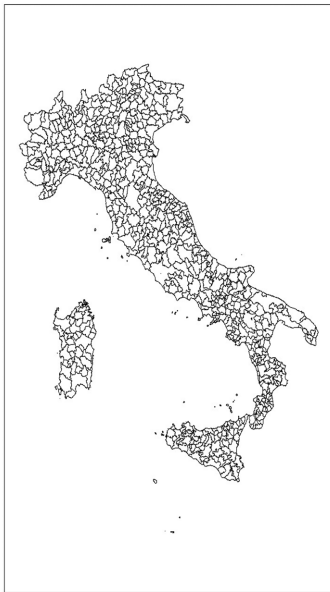
Local districts (n = 784)