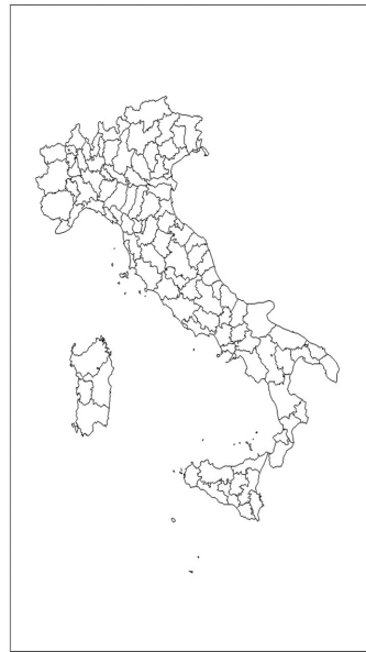
NUTS-3 prefectures (n = 103)