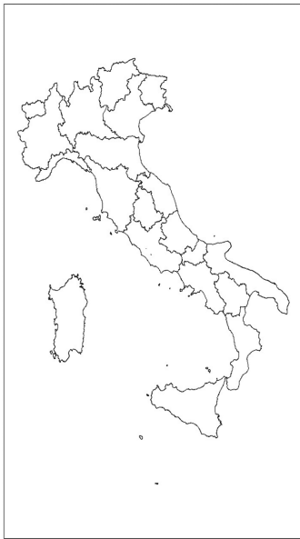
NUTS-2 regions (n = 20)